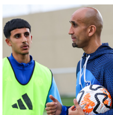
PFA COACHING TEAM